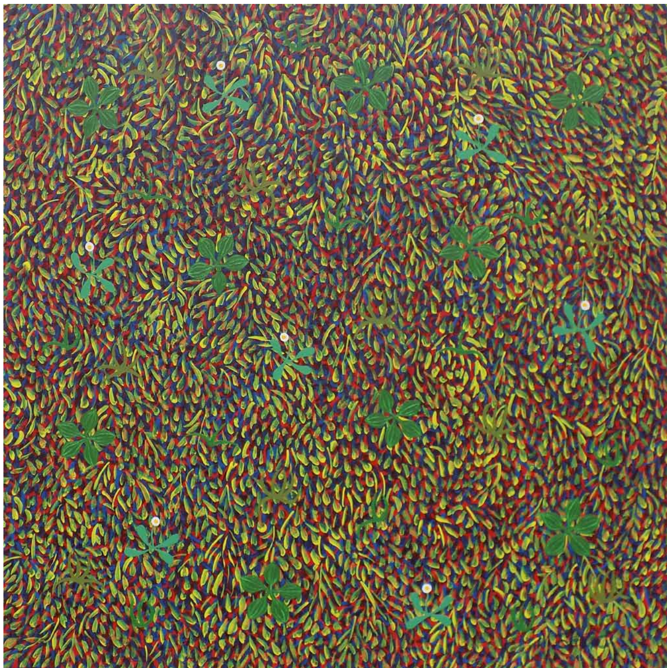
LIVADA. akril, platno, 100 x 100 cm, 2015.