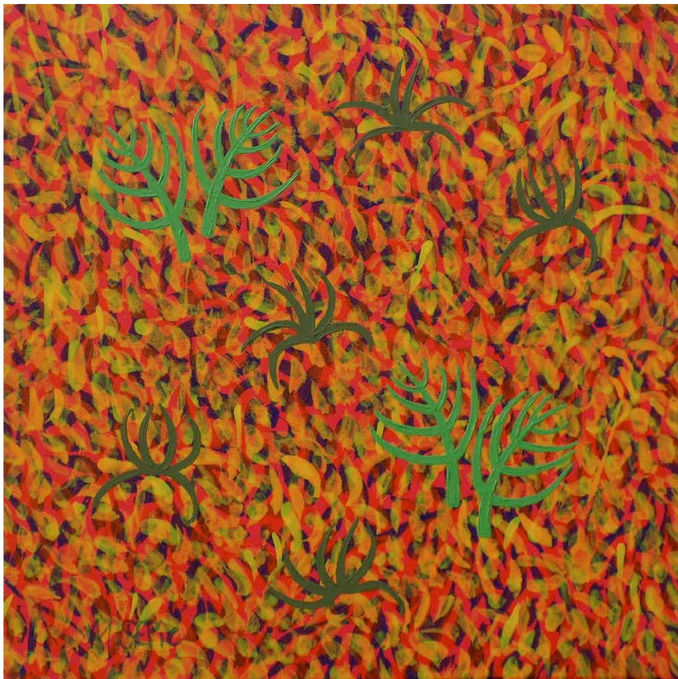
LIVADA, akril, platno, 40 x 40 cm, 2015.