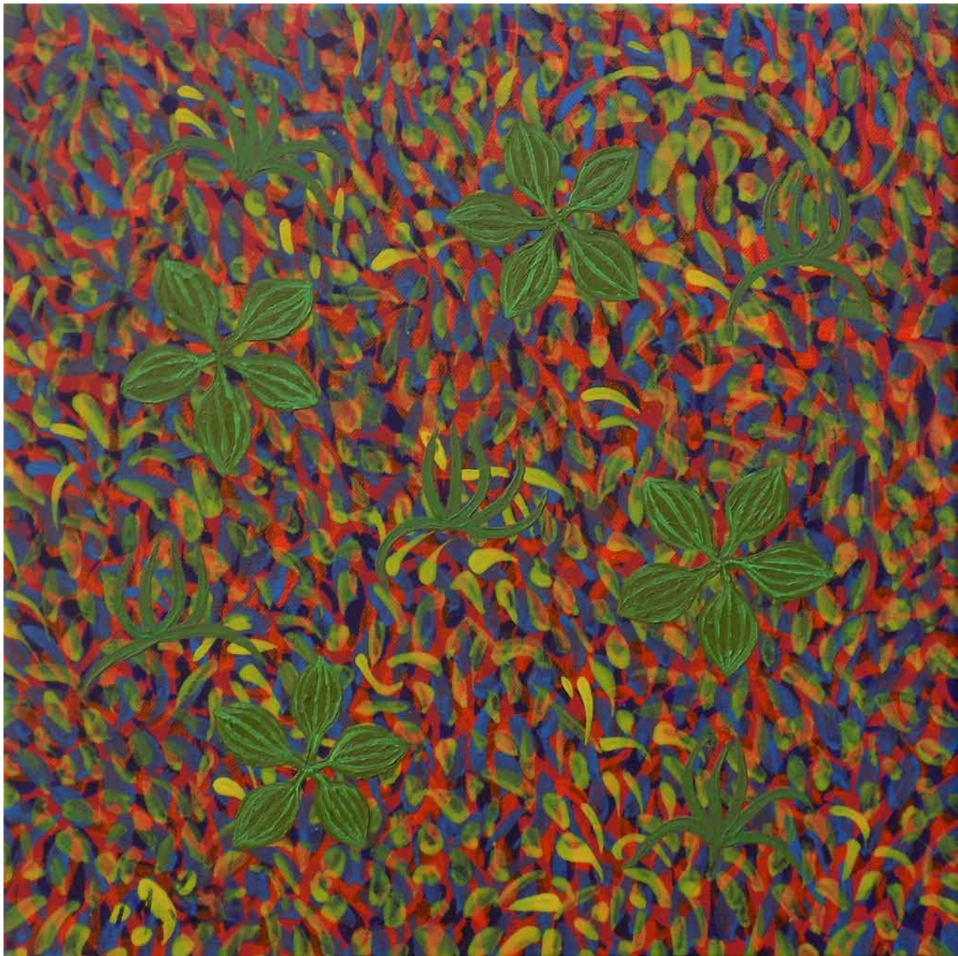
LIVADA, akril, platno, 40 x 40 cm, 2015.