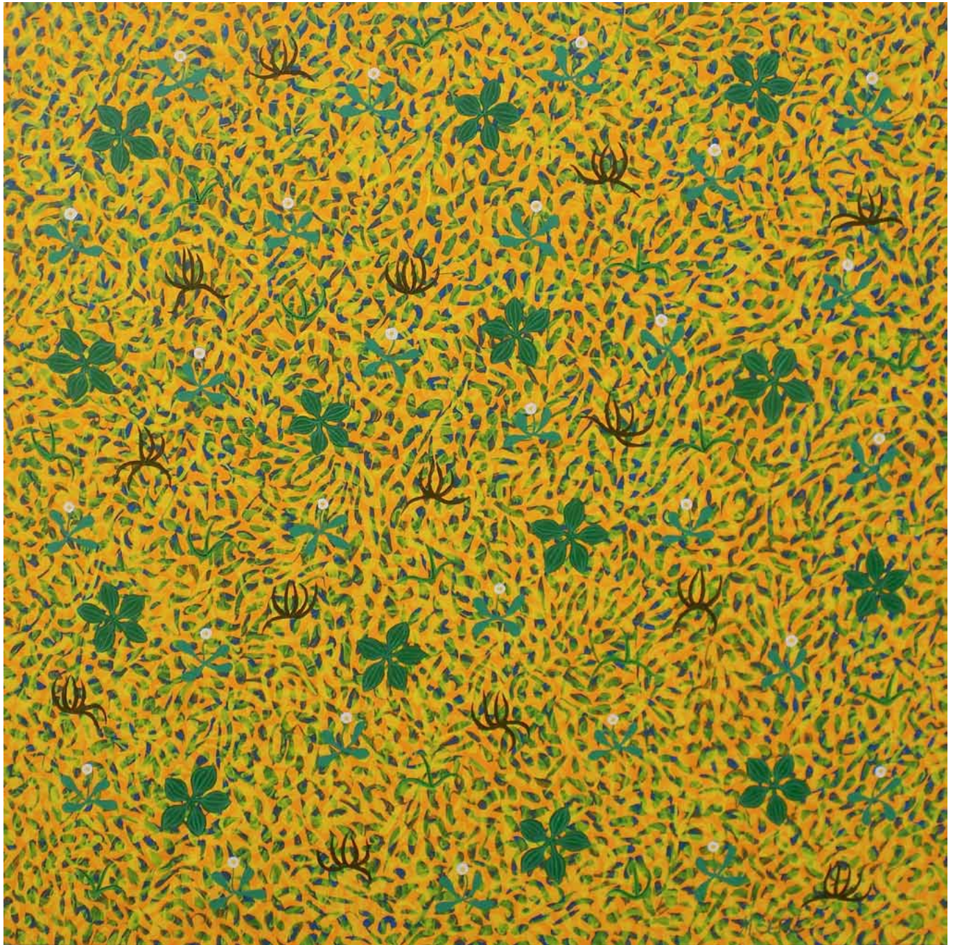
LIVADA. akril, platno, 116 x 116 cm, 2014.