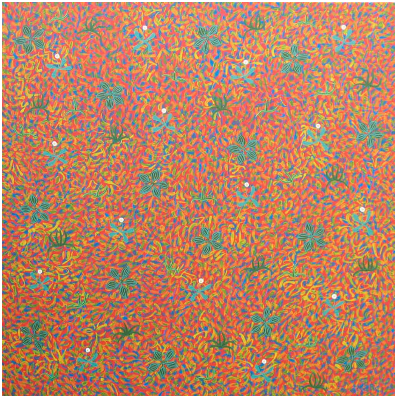
LIVADA. akril, platno, 116 x 116 cm, 2014.